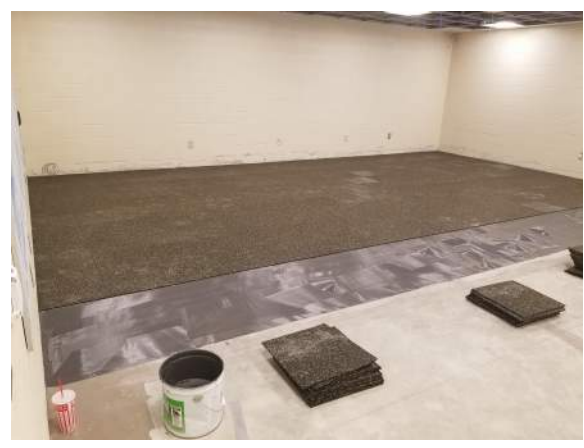
Flooring Washington Level Health Classroom/ Cardio