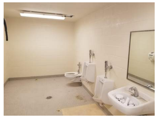
Painting Washington Level Locker Rooms