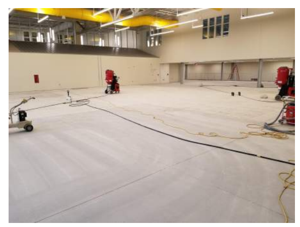
Prepping Dinning Commons Floors for Polish