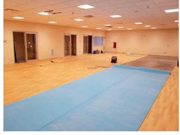
Flooring Washington Level Multipurpose Room